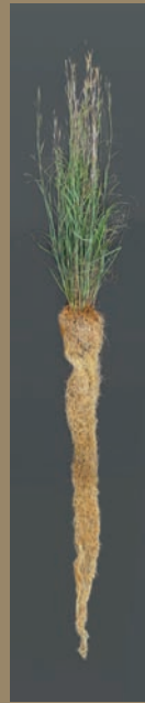
Native big bluestem root

The root systems of native prairie grasses and wildflowers can reach 6-10 feet deep. Native plants are more effective at improving water infiltration and quality and reducing soil erosion on steep roadside slopes compared to non-native, or introduced grasses. Because of their deep roots, native plants can be effective competitors with noxious weeds or invasive plant species.